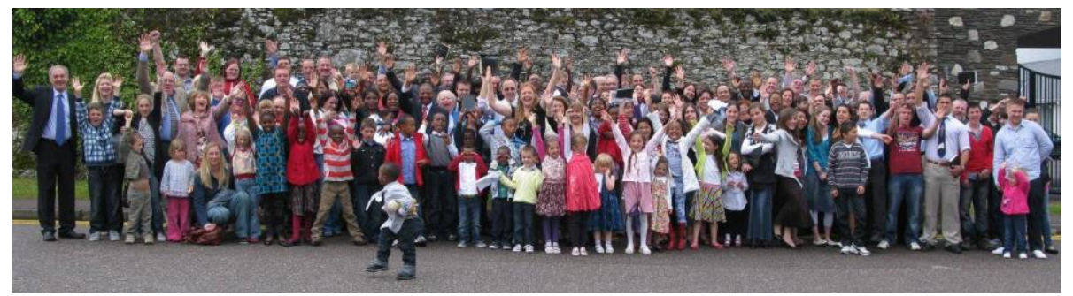
For more information about our church see www.biblebc.com

Below is a group shot of our people in Bible Baptist Church, Ballincollig